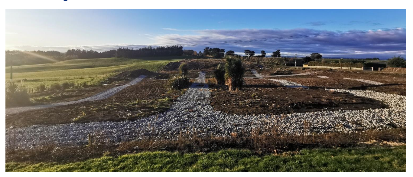
Figure 1: Mt Stewart Landscaping

remember those we've lost. This memorial garden will be designed to complement the existing Settlers Memorial, and will be developed in consultation with local lwi to ensure their role as guardians of the land is honoured.